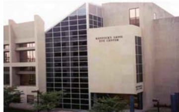
Kentucky Lions Eye Founda- tion Building

Time: Jan. 8, 2011 Place: Roy Caywood Sr. Leadership Confer- ence at Holiday Inn— Hurstbourne, Louis- ville, Ky.