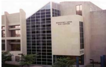
Kentucky Lions Eye Foundation Building